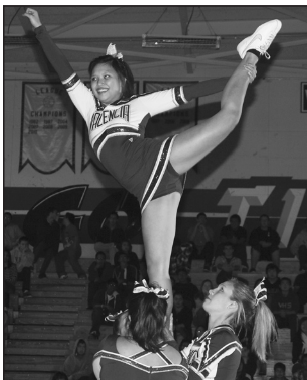
CHEER SHOWS THEIR ROUTINE DURING THE ASSEMBLY.