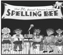
PAGE 3: SPRING MUSICAL IS HERE