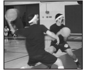
PAGE 4: DODGEBALL RESULTS

PLACENTIA'S OLDEST CONTINUOUSLY RUNNING NEWSPAPER, EL TIGRE IS A STUDENT-RUN NEWSPAPER IN THE PLACENTIA-YORBA LINDA UNIFIED SCHOOL DISTRICT